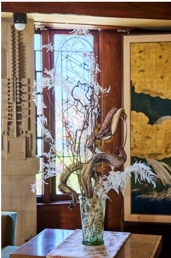
LIVING ROOM. Bird of Paradise ( Strelizia nicolai ) leaves, Plumosa Fern ( Asparagus plumosus ), Bracken Fern ( Pteridium ), and Asian Bittersweet ( Celastrus orbiculatus )