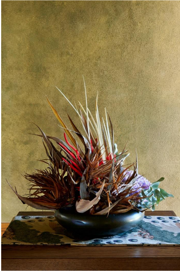
LIVING ROOM ALCOVE. Giant Bird of Paradise ( Strelitzia nicolai ), Hydrangea ( Hydrangea paniculata ), miniature Foxtails ( Setaria ), Mottlecah ( Eucalyptus macrocarpa )