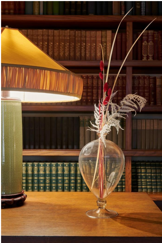
STUDY. Canary Grass ( Phalaris brachystachys ) (red plumes), Bracken Fern ( Pteridium ), Lily ( Lilium ) leaves.