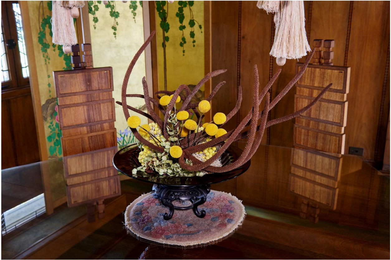
DINING ROOM. Bismarck Palm ( Bismarckia nobilis ) brown flower stems, yellow Billy Balls ( Craspedia ), and small dried flowers