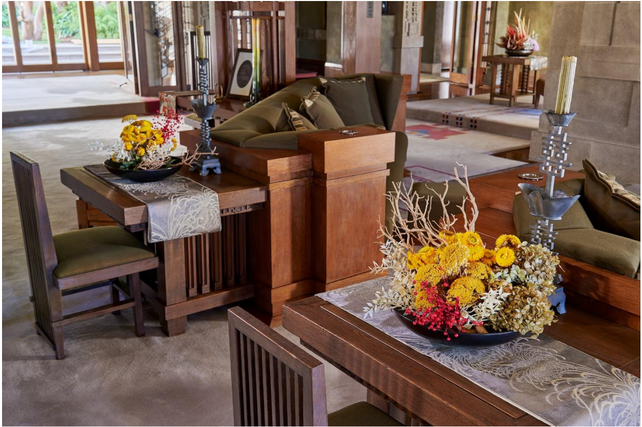
LIVING ROOM. Manzanita branches ( Arctostaphylos ), Yarrow ( Achillea millefolium ), Straw Flowers ( Xerochrysum bracteatum ), and Butcher's Broom ( Ruscus auleatus )